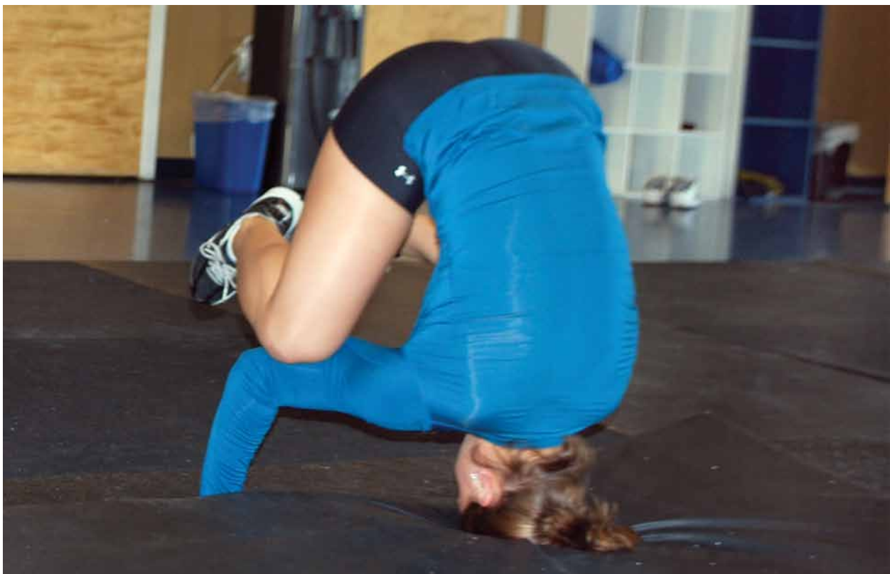
Tripod—Put your hands down by the mat (head slightly in front of the hands) and get the knees on the elbows. Press hands into the ground to prevent all load being held by the head and neck.

Athletes are separated into four levels, each with its own set of exercises and progressions geared toward achievement of more and more challenging goals. Most goals, however, are written with CrossFit performance in mind, so do not mistake this as a program of pure gymnastics training.