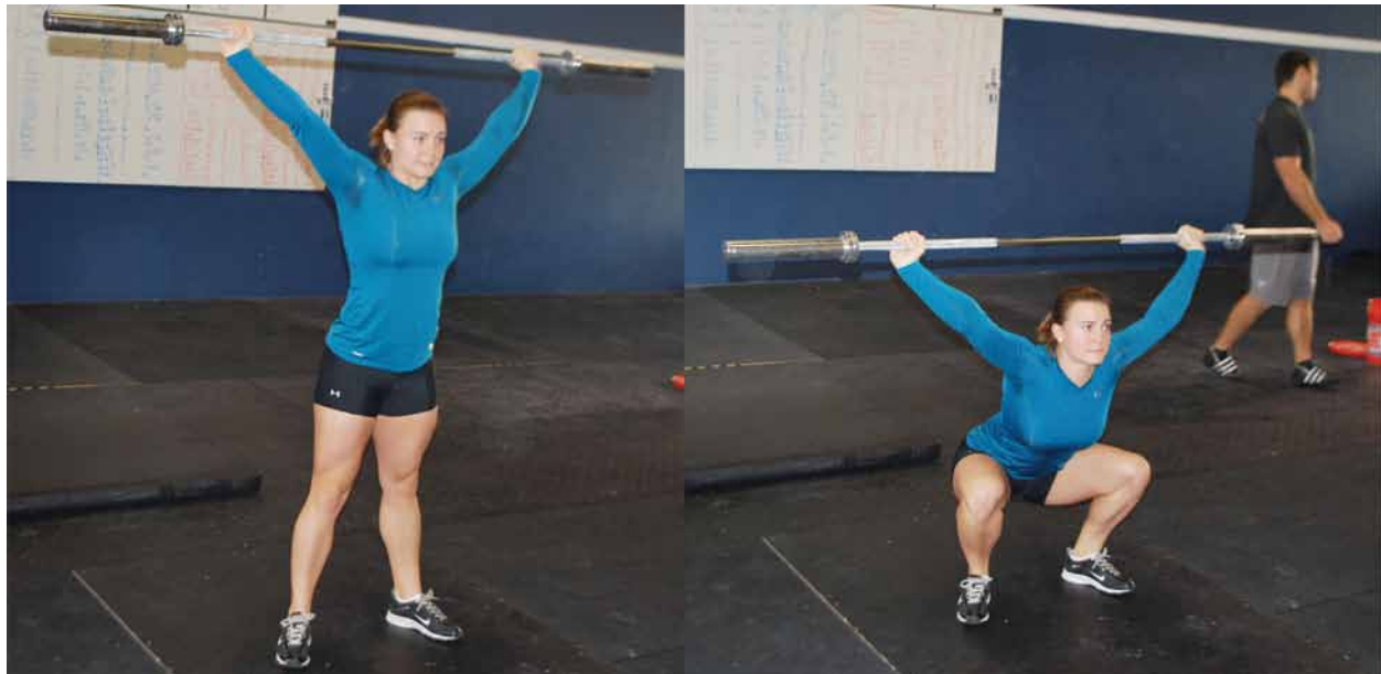
Overhead squat—Use PVC or training/women's/men's bar. Push your knees out the entire time during descent and ascent. Lock the elbows hard.

Athletes can only advance to the next level when all the requirements are completed. If there's only one requirement left to allow movement to the next level, it's that much more of a reason to emphasize it and complete it. Once there's only one thing left to complete, more time can be allotted to practicing that element. If you can easily do all requirements for one level but fail to qualify for the next level, continue at the current level of ability while focusing on the weakness until it's no longer a weakness.