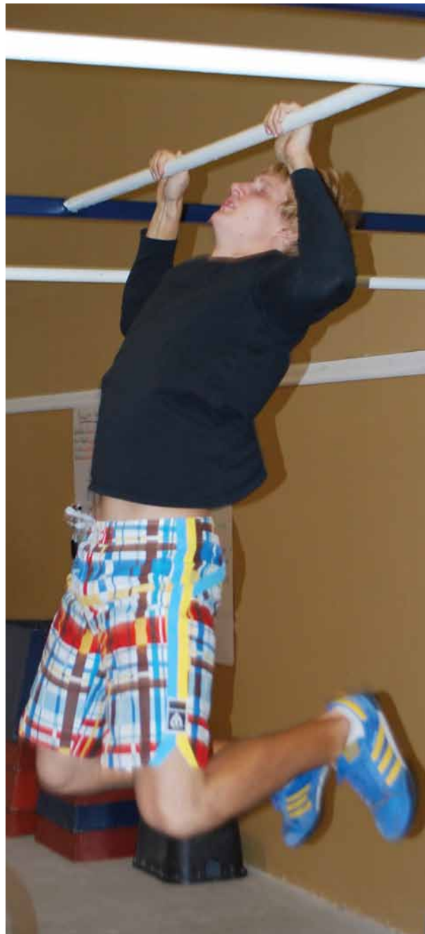
Butterfly kip —Watch the Butterfly Kip Tutorial on YouTube for instructions.